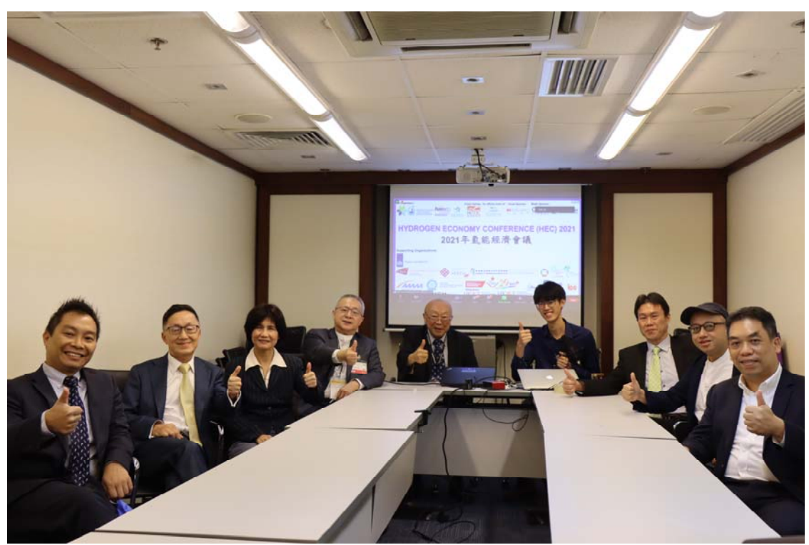
Group Photo of the Organizing Committee of HEC2021 at the Conclusion of the Conference, Celeberating another Great Conference and Great Success!